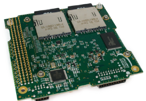
SD card slots