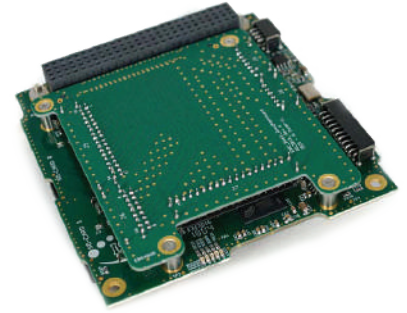
FM Daughter Board