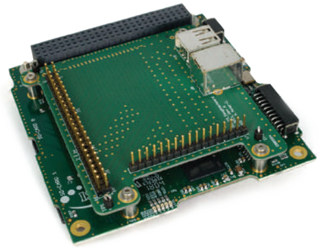
EM Daughter Board