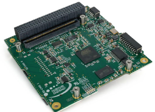
SD card slots