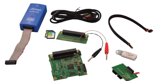
iOBC product contents